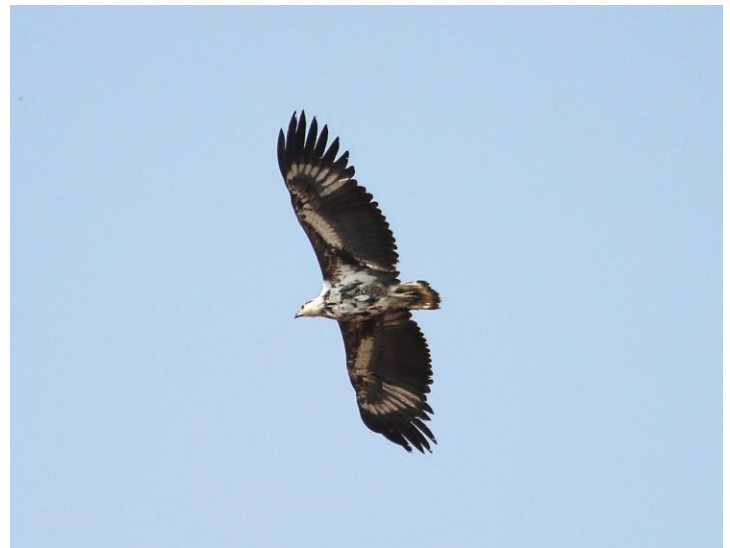
Immature Fish Eagle – Visarend [Michael Erasmus]