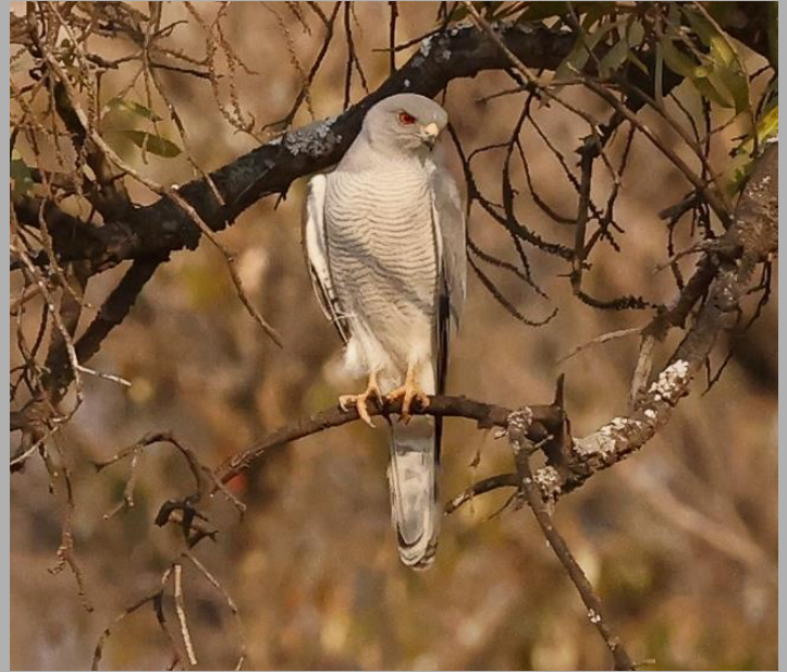
Shikra – Gebande Sperwer & White-backed Ducks – Witrugeend [Marlou Schalkwyk]

In total, we walked almost 4 km and most of us were very hot and tired when we got to the vehicles. There was no shade and with the four hours LOOOOONG GONE we decided to do the list via WhatsApp. It was exhausting but totally worth it. To anyone going to Mkhombo, be prepared for that walk and start walking early. The little bay surrounding lily pads is a gem! In total we identified 101 species on the day.