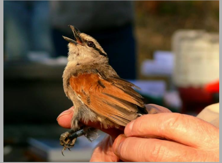
Brown-crowned Tchagra – Roovlerktjagra & Arrow-marked Babbler – Pylvlekkatlagter [Andrió de Vries]