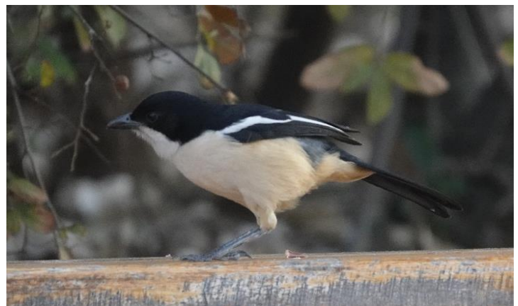
Southern Boubou – Suidelike Waterfiskaal [Reinier Meyjes]