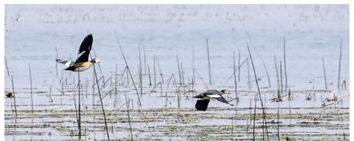
African Pygmy Geese