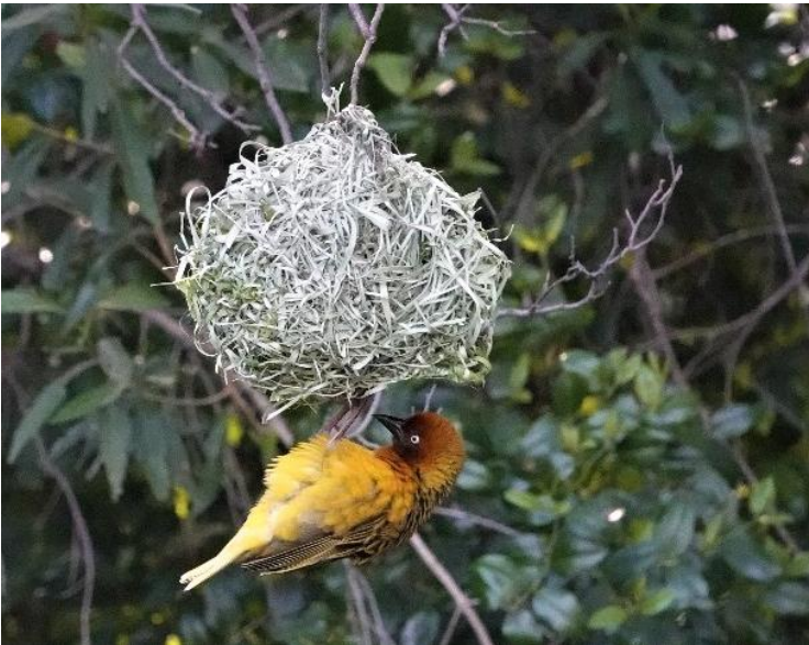
Cape Weaver – Kaapse Wewer [Reinier Meyjes]