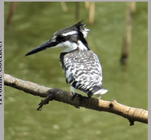
Pied Kingfisher – Bontvisvanger [Ivonne Coetzee]

Four different species of kingfisher at the Hex River was also a nice find.