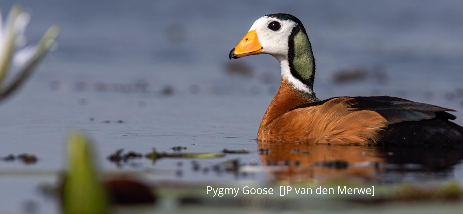
Pygmy Goose [JP van den Merwe]