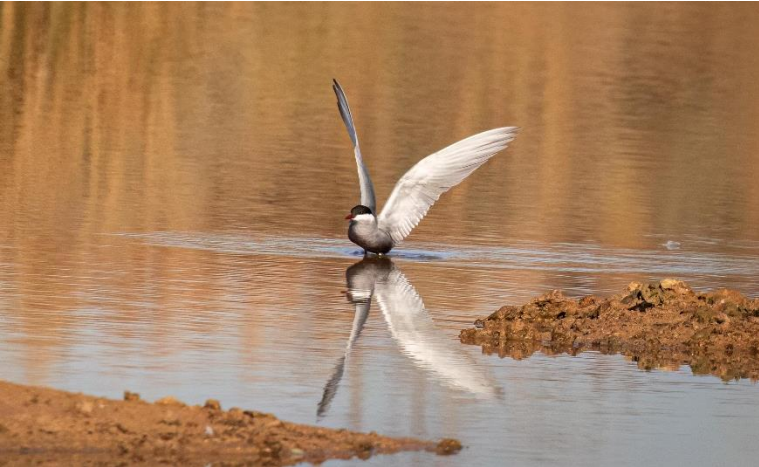
Whiskered Tern [JP van der Merwe]