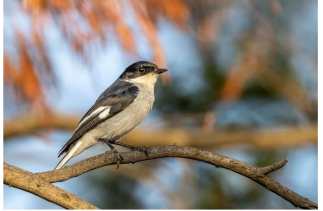
Fiscal Flycatcher [Johan Botha]