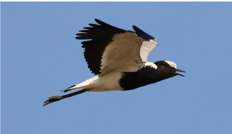
Blacksmith Lapwing [Danie van Zyl]