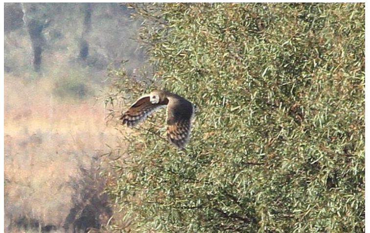
Marsh Owl [Craig Green]