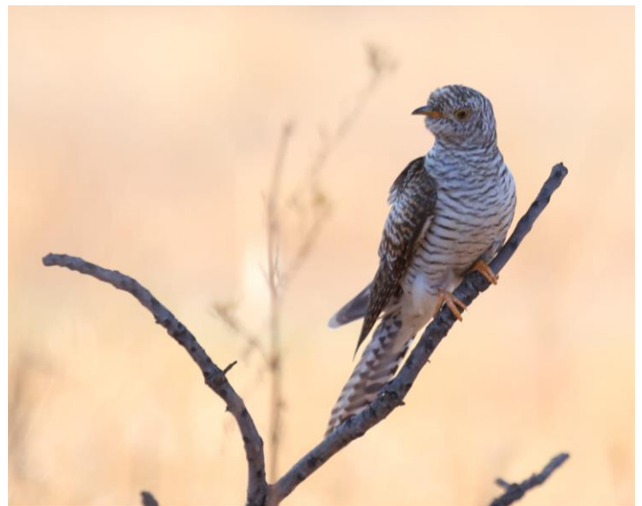
Juvenile Common Cuckoo [Daan van de Wetering]

These sightings were compiled from various social media Wider Gauteng Rarity sources. - Ed.