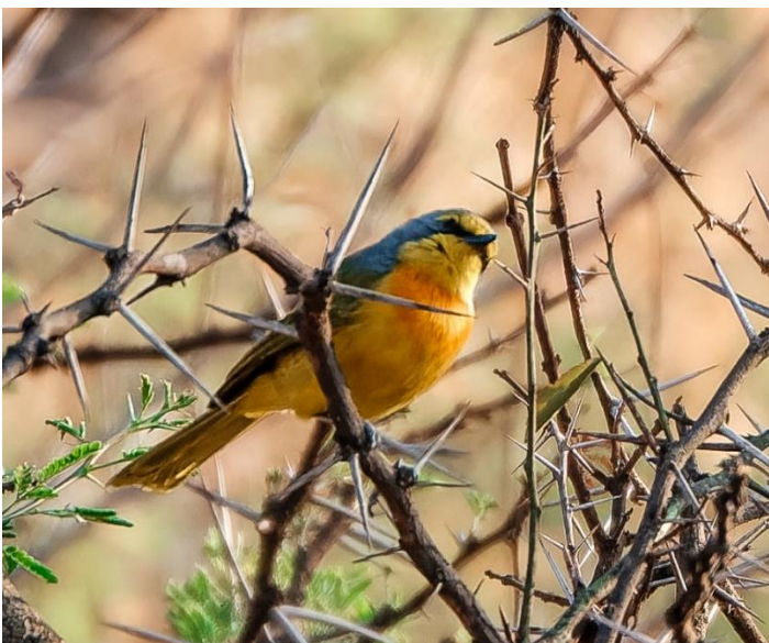
Orange-breasted Bush-Shrike [Wihan Barnard]