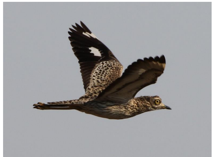
Spotted Thick-knee [Danie van Zyl]