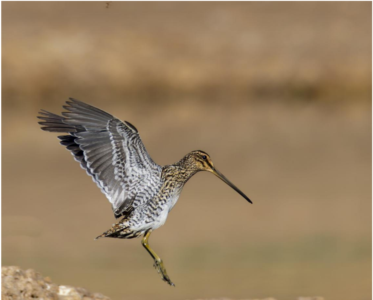
African Snipe [Sean Naudé]

Boekenhoutkloof is all about African Snipes! This outing also lent ample opportunities for birds-in-flight photography – according to JP van der Merwe, who guided this outing.