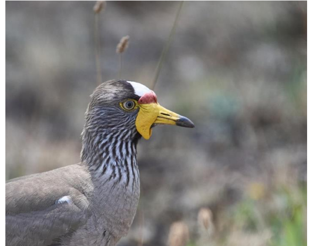
African Wattled Lapwing