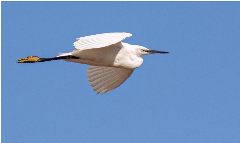
Western Cattle Egret [JP van der Merwe]