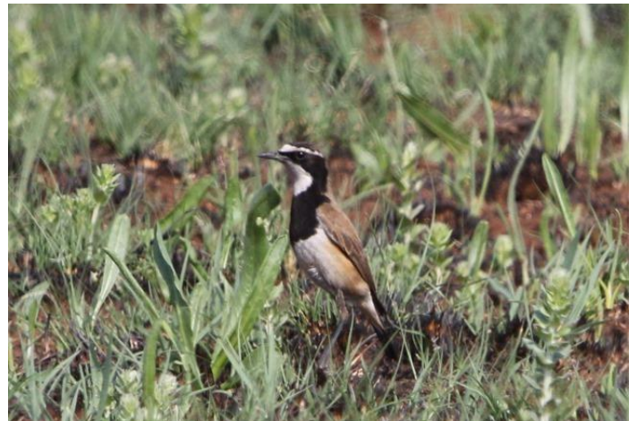
Capped Wheatear [Danie van Zyl]