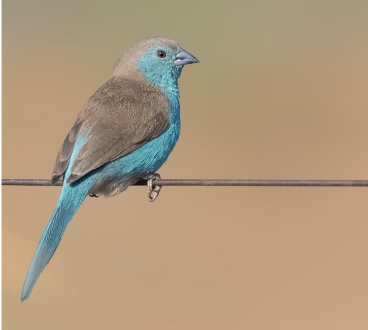
Blue Waxbill [Marna Buys]

Despite raging veld fires that destroyed some 12 houses in this area a few weeks ago, enough of the natural bushveld remained to make this a very worthwhile morning of birding under the guidance of Marna Buys, with 76 species seen. Highlights were Black Sparrowhawk and Ovambo Sparrowhawk, with a skulking warbler that refused to unmask its identity by singing. The photographs are proof enough of a successful birding walk!