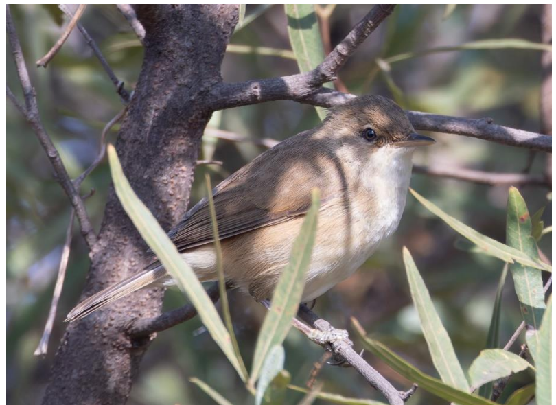
Common Reed Warbler [Marna Buys]