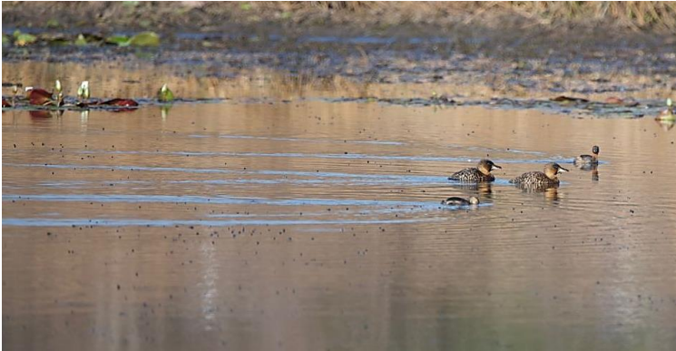
White-backed Duck