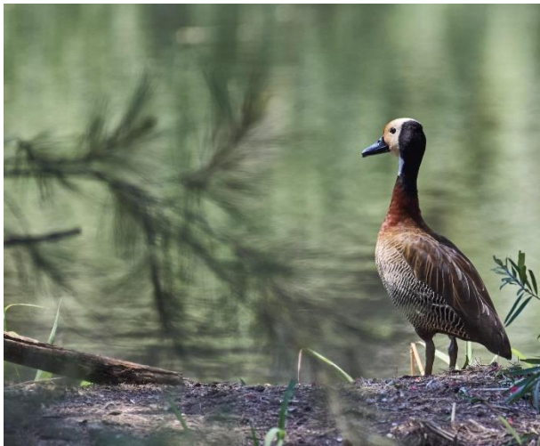
White-faced Whistling Duck