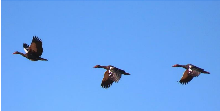
Spur-winged Geese [Thea Jenkins]