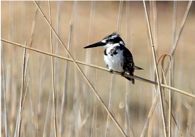
Pied Kingfisher [Craig Green]