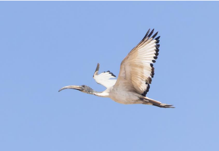
African Sacred Ibis [Marna Buys]