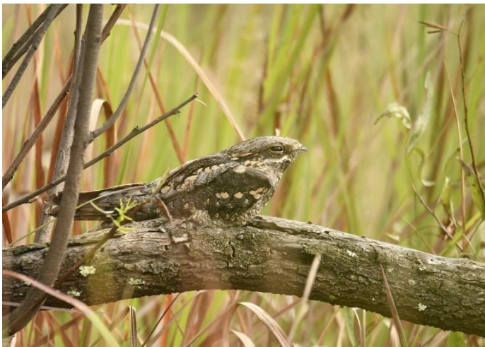
European Nightjar [Sheleph Burger]

A BLNG group found various out-of-range and interesting species at Markon River Lodge. The first was a flock of some 11 Southern Bald Ibis . A European Nightjar was seen and later, a Booted Eagle . Not provincial rarities, but other good finds there were an African Yellow Warbler and a Cape Bunting .