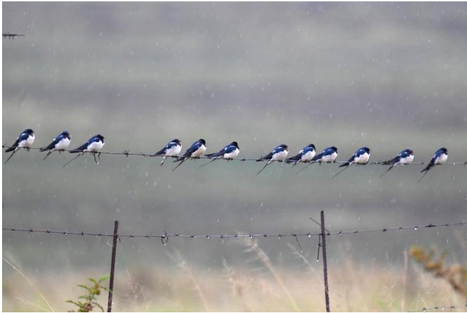
Barn Swallows in the rain [Kobie van Eeden]