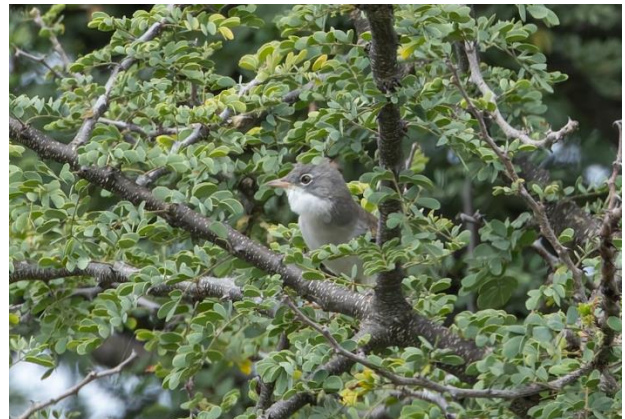
Common Whitethroat