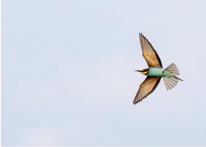
European Bee-eater [JP van der Merwe]