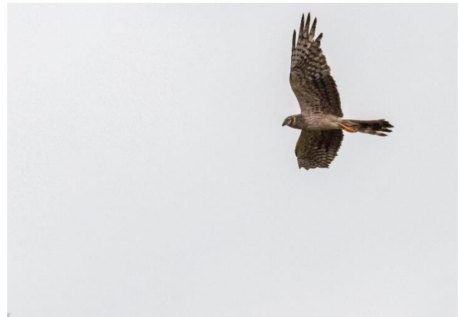
Pallid Harrier