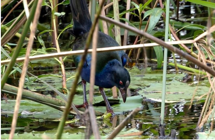
Allen's Gallinule