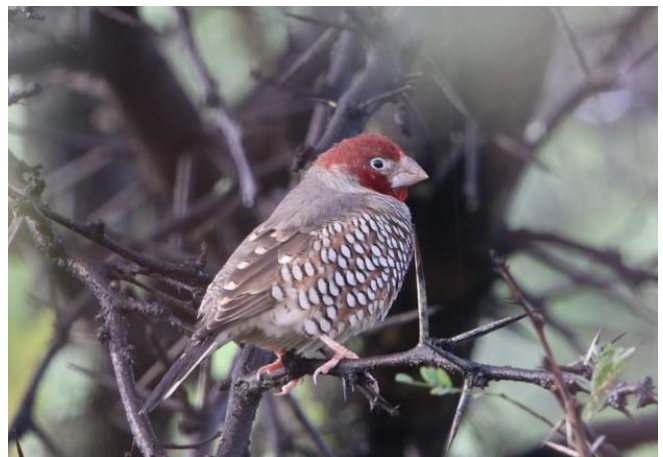
Red-headed Finch [Adelle van Zyl]