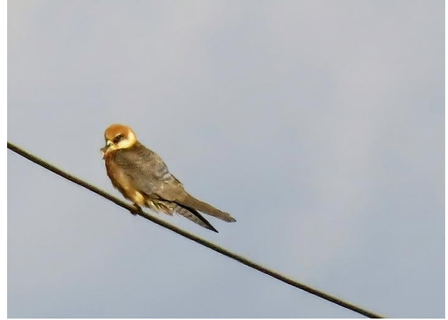
Red-footed Falcon [Ivonne Coetzee]

Sightings of Red-footed Falcon were particularly numerous and they were seen at Zaagkuil drift Road and Vlaklaagte. Black-rumped Buttonquail and Montagu's Harrier were recorded at Vlaklaagte (Marna Buys). JP van der Merwe found a Pallid Harrier there as well.