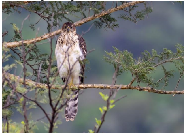
Black Sparrowhawk [Hein Duvenhage]