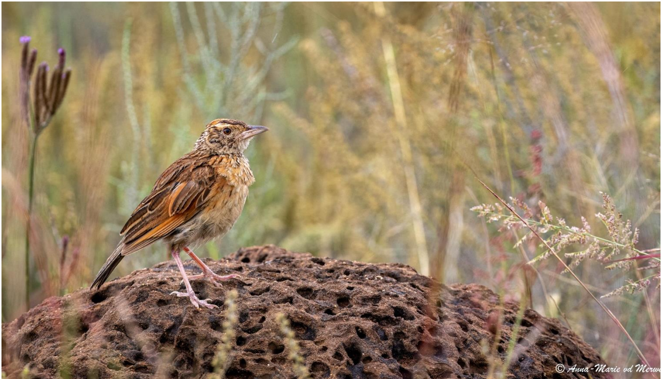
This wet Rufous-naped Lark says it all