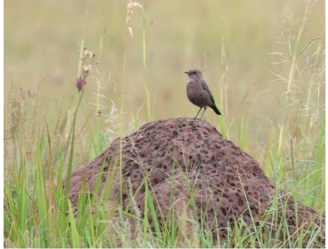
Ant-eating Chat [Mags Webster]