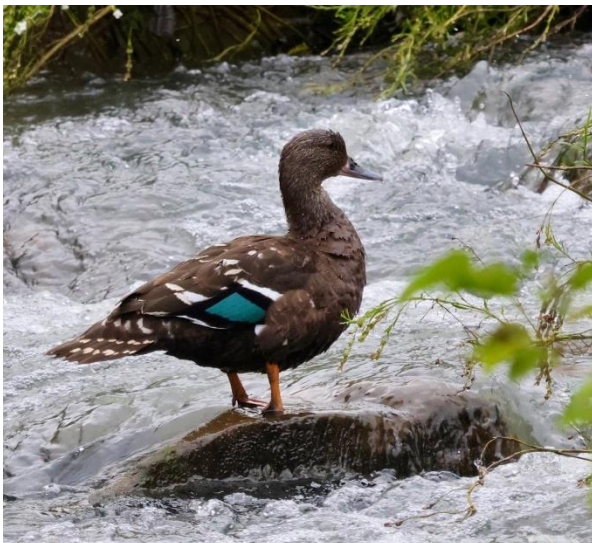
African Black Duck [AK Saib]