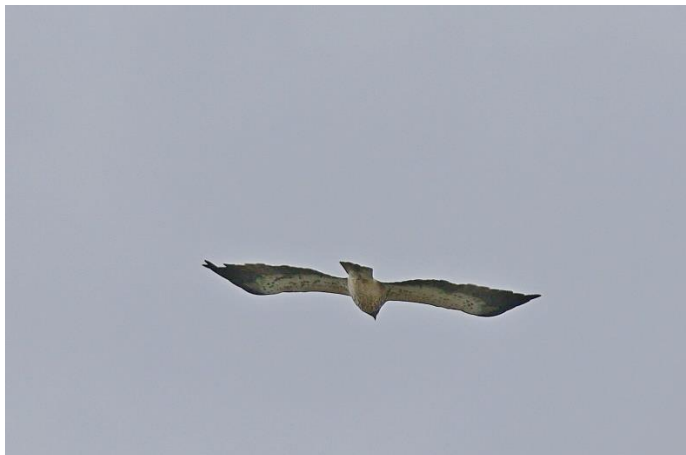
Booted Eagle [Pieter Heslinga]