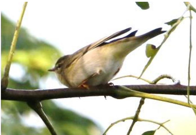
Icterine Warbler [Adelle van Zyl]