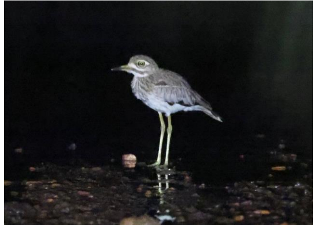
Water Thick-knee [Etienne Marais]

European Honey Buzzards were seen at Roodeplaat NR, as well as at Rietvlei NR.