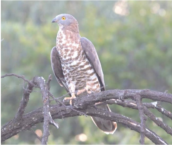
European Honey Buzzard