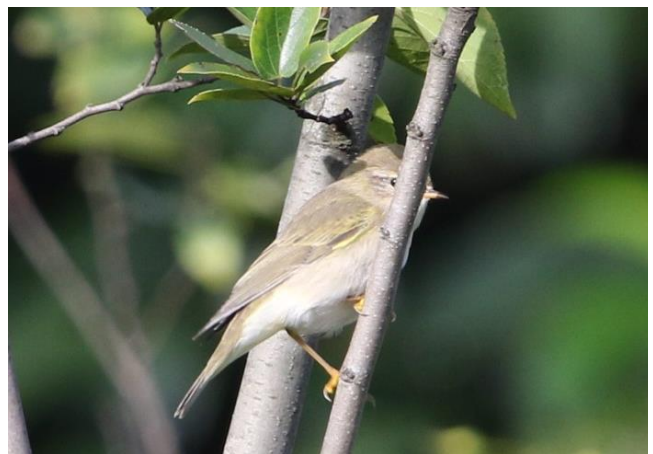
Icterine Warbler [Adelle van Zyl]