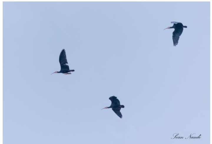
Southern Bald Ibis [Sean Naudé]