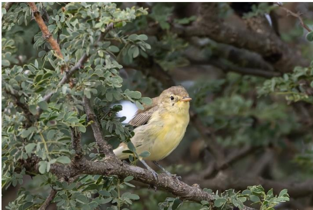
Icterine Warbler [Marna Buys]

Zaagkuil drift Road and warblers are synonyms this time of the year. Doug Newman spotted the first River Warbler at the Platte River near Kgomo-Kgomo. Thrush Nightingale and Water Thick-knee were reported (Etienne Marais) and Common Whitethroat and Icterine Warblers were also photographed there.