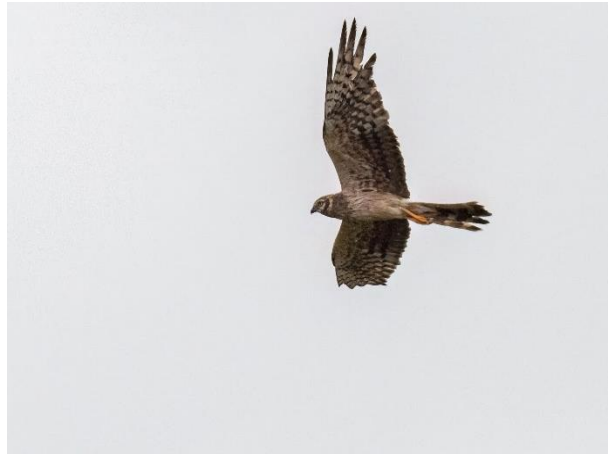
Pallid Harrier