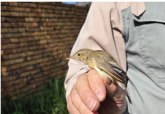
Willow Warbler [Nicole Crisp]