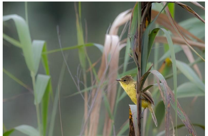
African Yellow Warbler [Sean Naudé]

Sandy Neveling found a Black-necked Grebe family on private property near Deneysville.