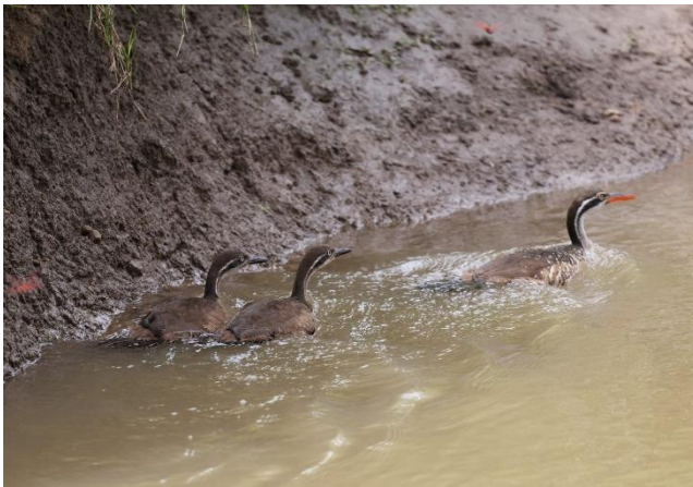
African Finfoot [Pieter Heslinga]

Pieter Heslinga photographed an African Finfoot with two juveniles on Crake Road, and Joshua Winter reported a Dwarf Bittern at Onderstepoort.