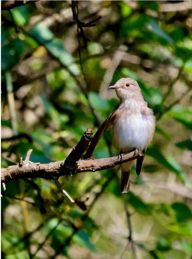
Spotted Flycatcher

This outing once again proved that some of the best birding in Gauteng can be had in our city Reserves. A pair of Verreaux's Eagles, Giant and Half-collared Kingfishers, Ovambo and Black Sparrowhawks, and even a Marsh Warbler made this walk a resounding success.