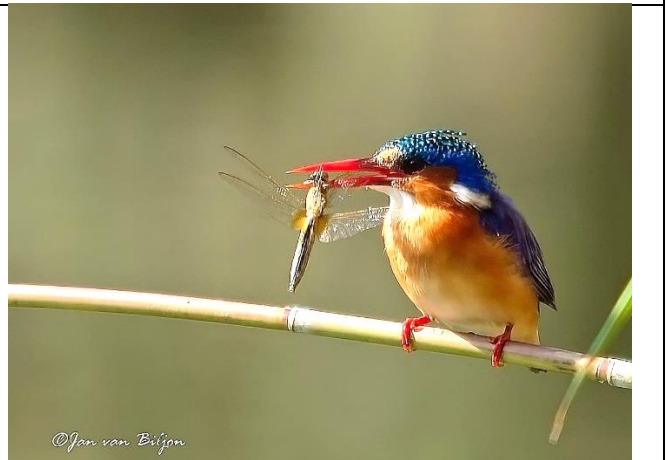
December: Malachite Kingfisher – J v Biljon