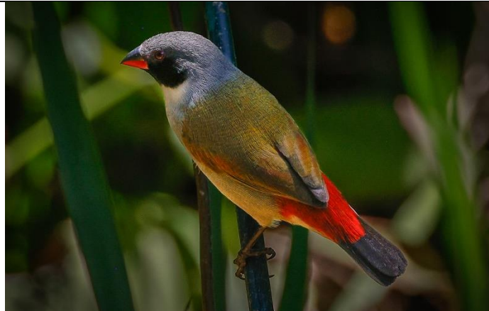
March: Swee Waxbill – Marlou Schalkwyk