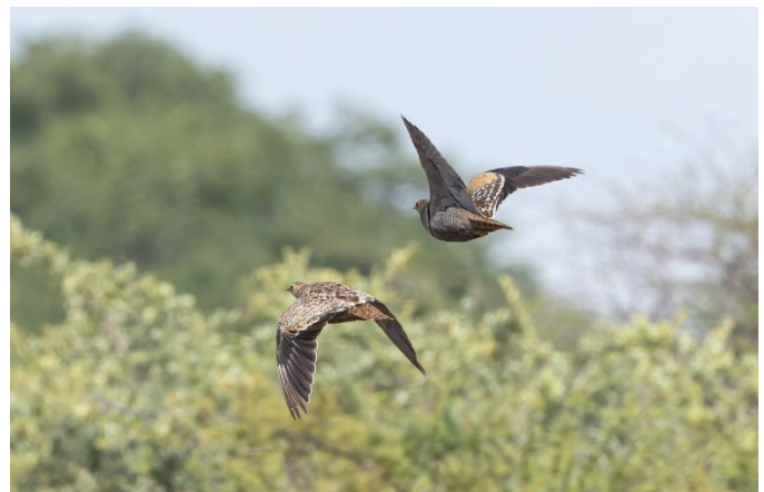
Double-banded Sandgrouse [Marna Buys]