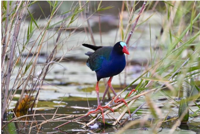
Allen's Gallinule