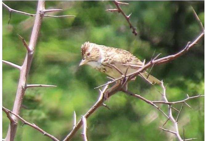
Monotonous Lark