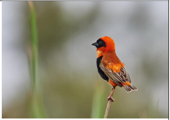
October: Southern Red Bishop – W vd Merwe