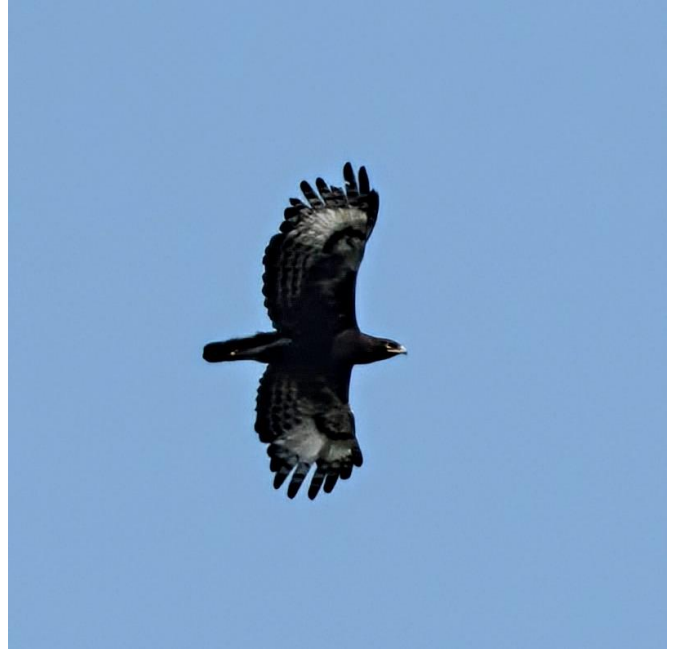
Long-crested Eagle [John Truter]