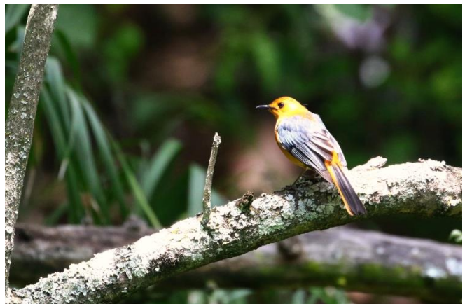
Red-capped Robin-Chat [Klaus Schmid]