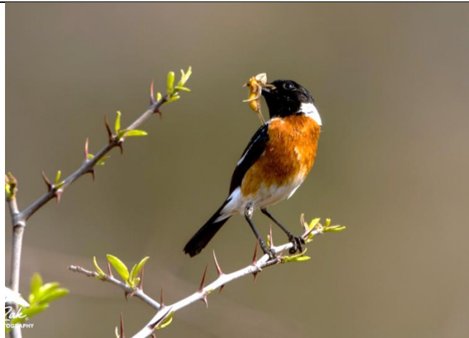
September: African Stonechat – Z Croukamp