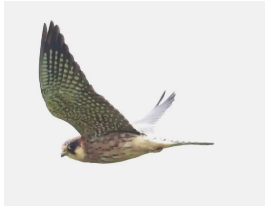
Red-footed Falcon