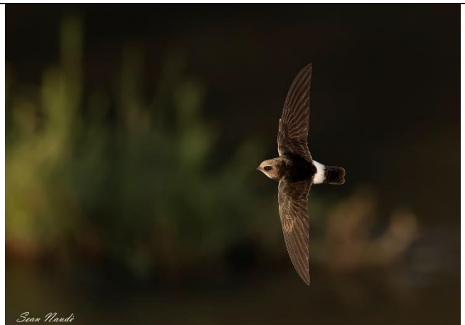
November: Little Swift