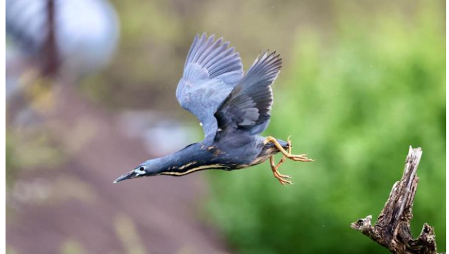
Dwarf Bittern