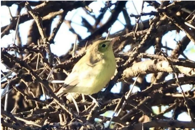
Icterine Warbler [Doug Newman]