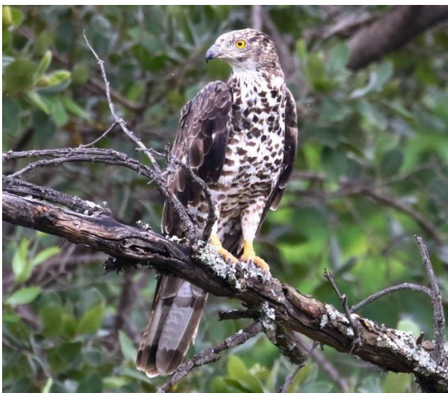
European Honey Buzzard