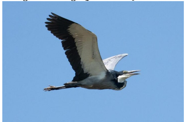
Black-headed Heron [John Truter]