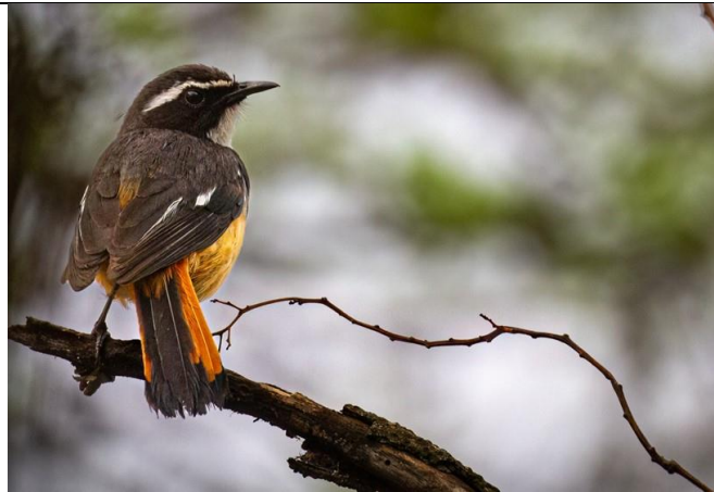
July: White-throated Robin-Chat – A vd Merwe