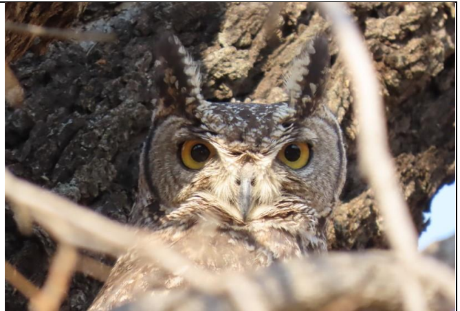
August: Spotted Eagle-Owl – C Kotze