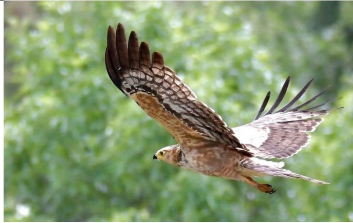
January: African Harrier-Hawk – S Burger