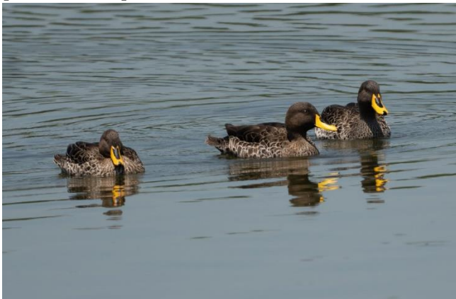
Yellow-billed Ducks [John Truter]