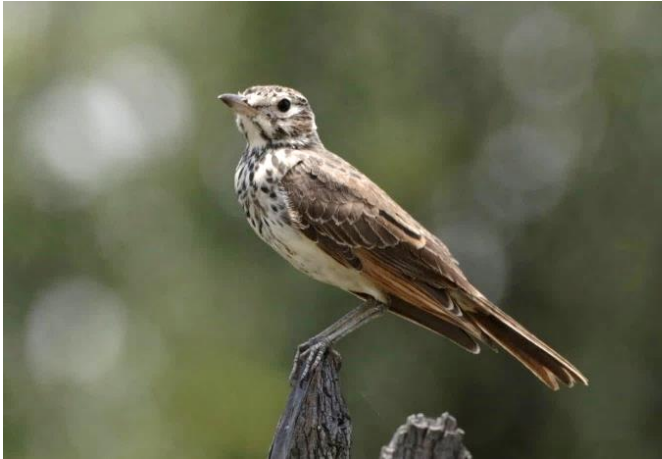
Dusky Lark [Peter Thompson]

A group of birders visiting Winterveld were treated to sightings of Double-banded Sandgrouse , Greater Painted-snipe , Cape Vulture , Dusky Lark and a surprise Monotonous Lark .