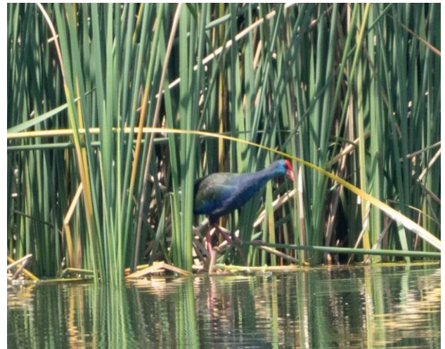
Purple (African) Swamphen [John Truter]