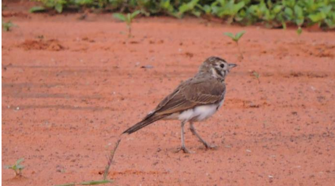
Dusky Lark [Attie Hartsliet]