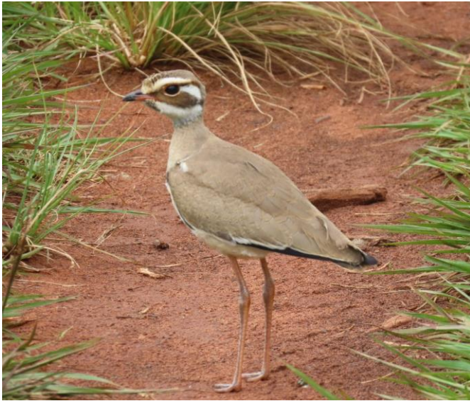
Bronze-winged Courser [Thea Jenkins]

Rietondale Proefplaas once again hosted various interesting species during December. Reinardt Haywood reported finding Bronze-winged Courser and Southern White-faced Owl , the latter not a rarity but still a novel find in suburban Pretoria. A Booted Eagle was also seen there and what appears to be annually returning, a pair of Dusky Larks .