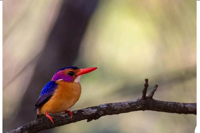
February: African Pygmy Kingfisher – A vd Merwe