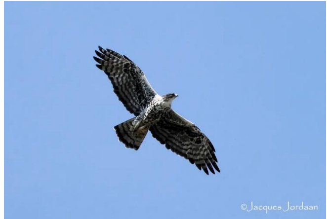
Ayres's Hawk-Eagle