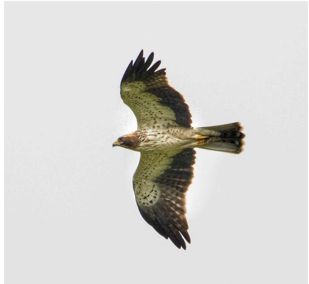
Booted Eagle [Abri Jordaan]