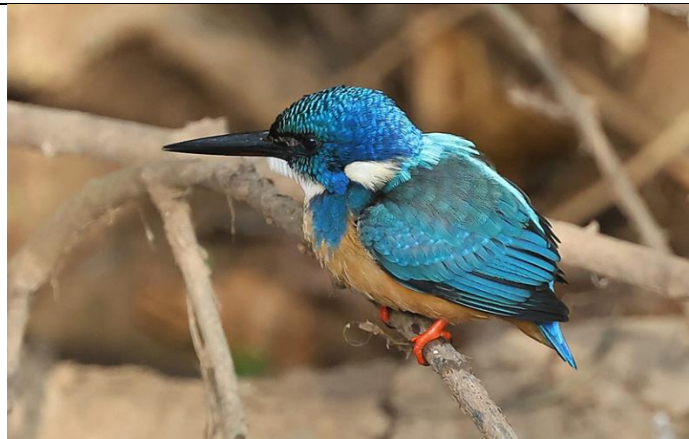
May: Half-collared Kingfisher