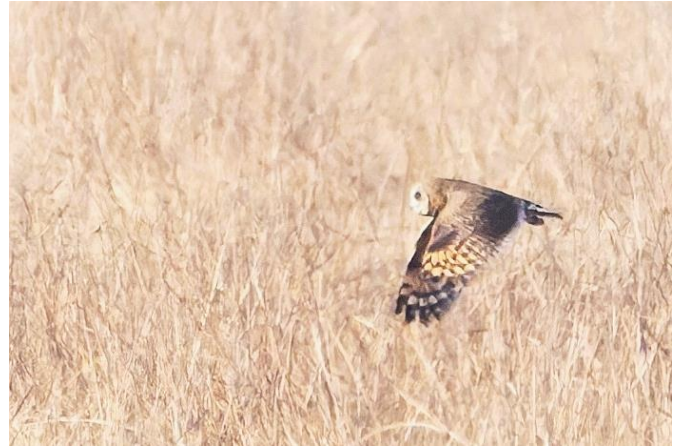
Marsh Owl