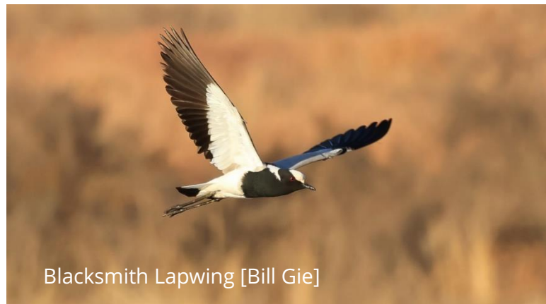
Blacksmith Lapwing [Bill Gie]