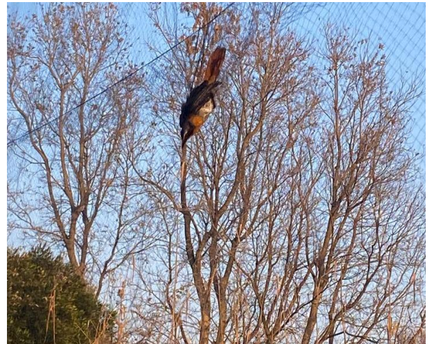
Cape Robin-Chat in the mist net.