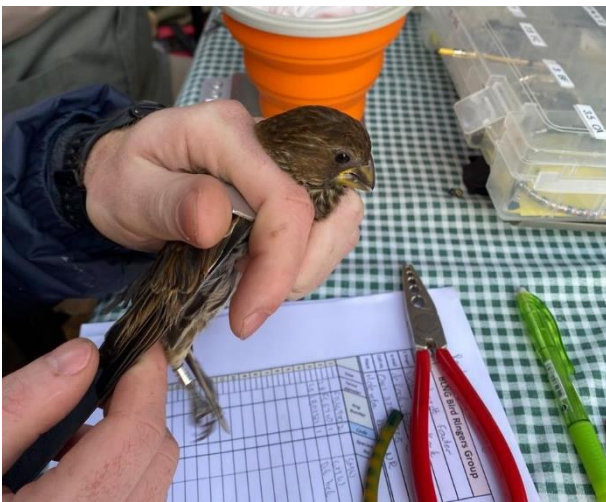
Thick-billed Weaver being measured