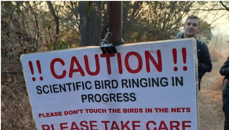
This outing was all about bird ringing!