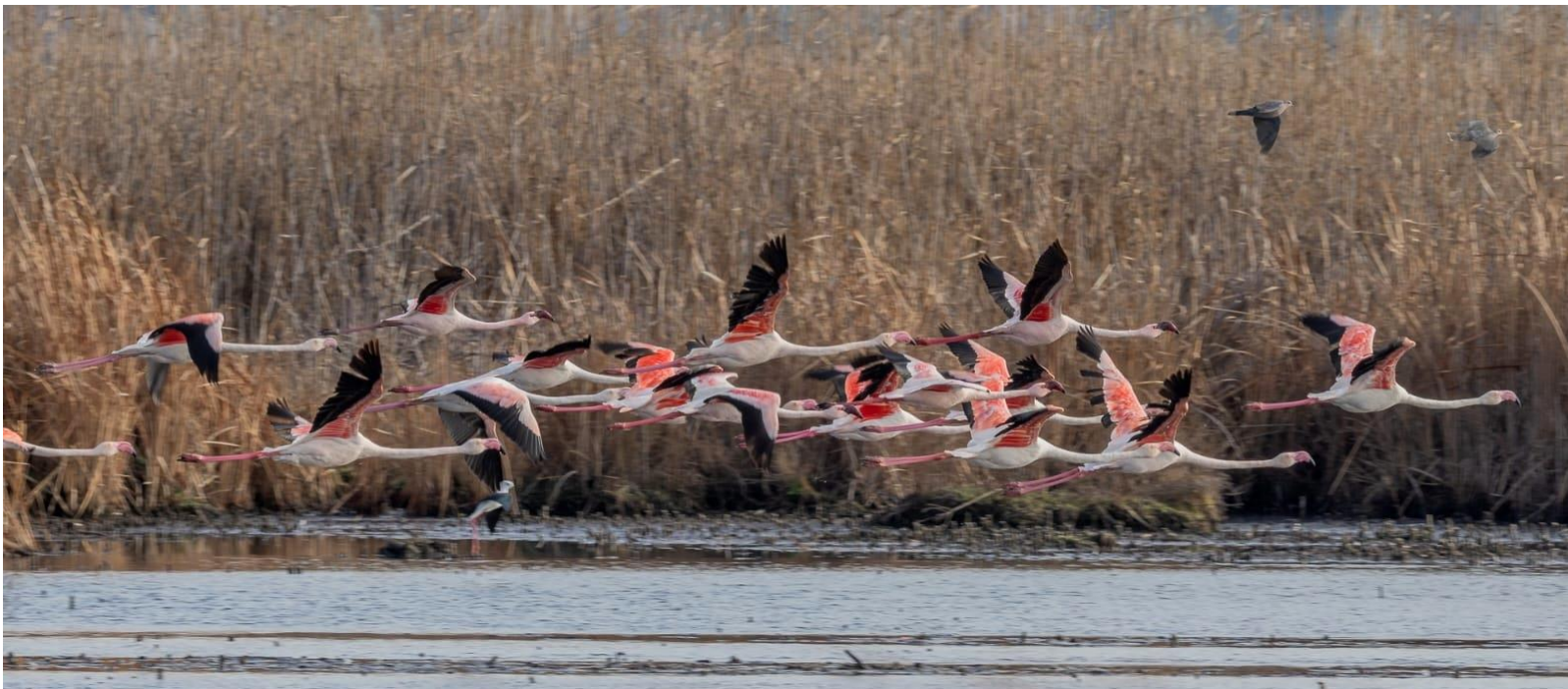
Greater Flamingos with possibly one or more Lesser Flamingos [Hannes van den Berg]