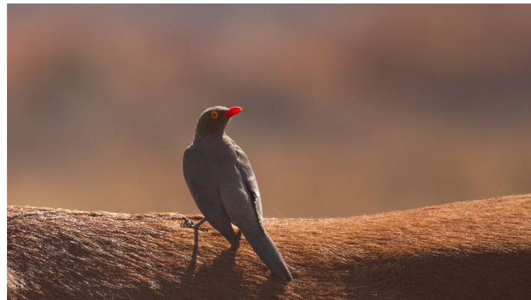
Red-billed Oxpecker [Anne-Marie vd Merwe]