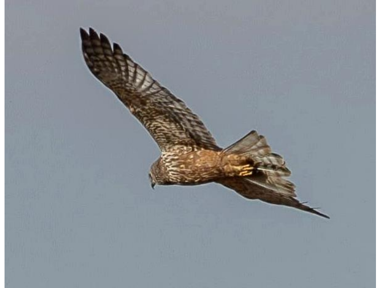
African Marsh Harrier