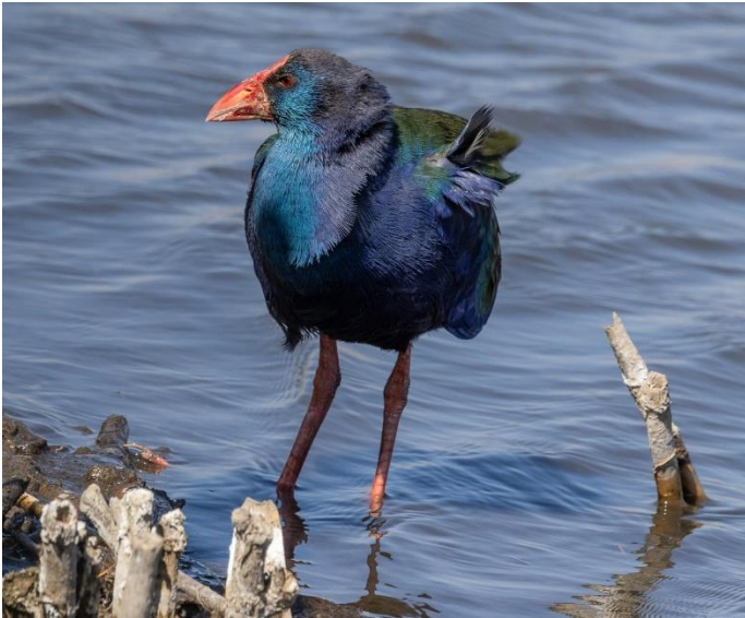
African Swamphen

With migrants returning from the northern hemisphere, Marievale is the place to visit in the hope of bagging a wader still in breeding plumage, or even a lifer. Despite many of the pans still being dry, 72 species were seen, with highlights African Marsh Harrier and even an African Rail on the way out. Hannes van den Berg led the outing.