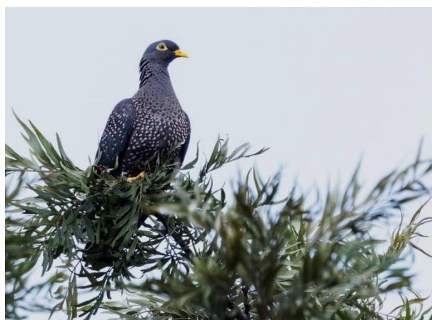
African Olive Pigeon – Geelbekbosduif [Marna Buys]