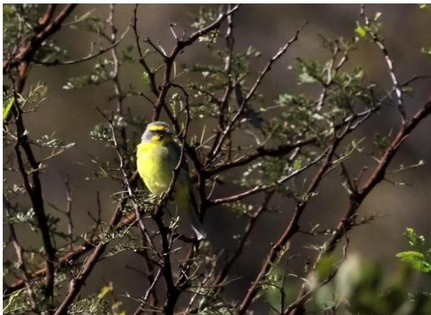
Yellow-fronted Canary