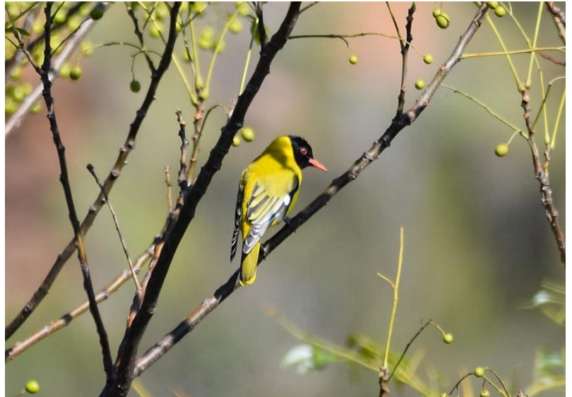
Black-headed Oriole [Gerdus Heydenrych]