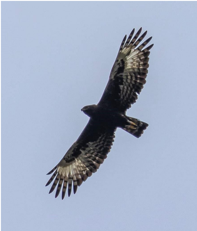
Long-crested Eagle [Hannes van den Berg]

Pat Ayling guided our BLNG group for a first excursion in this private reserve which includes portions of the Modderfontein Spruit, some dams, grassland, and hills.