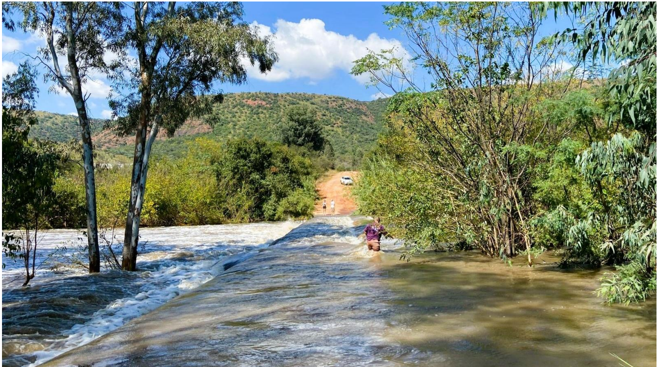
Hero of the day, testing the waters -too unsafe to cross

Keanu Canto, the outing leader, had a very unexpectedly adventurous day ahead as leader of the group – should they attempt to cross the swollen Wilge River in flood, as never seen before, or not? The group members had an astonishing seventeen lifers between them, with exciting finds such as Yellow-bellied Greenbul, Grey Tit-flycatcher, Brubru, African Firefinch and Bearded Woodpecker. Not to mention the memories of their exciting escapades of muddy crossings earlier on!