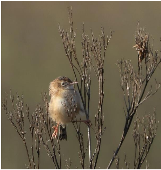
Zitting Cisticola