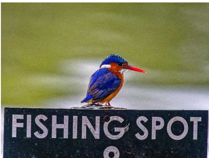
Law-abiding Malachite Kingfisher [Johan Croucamp]