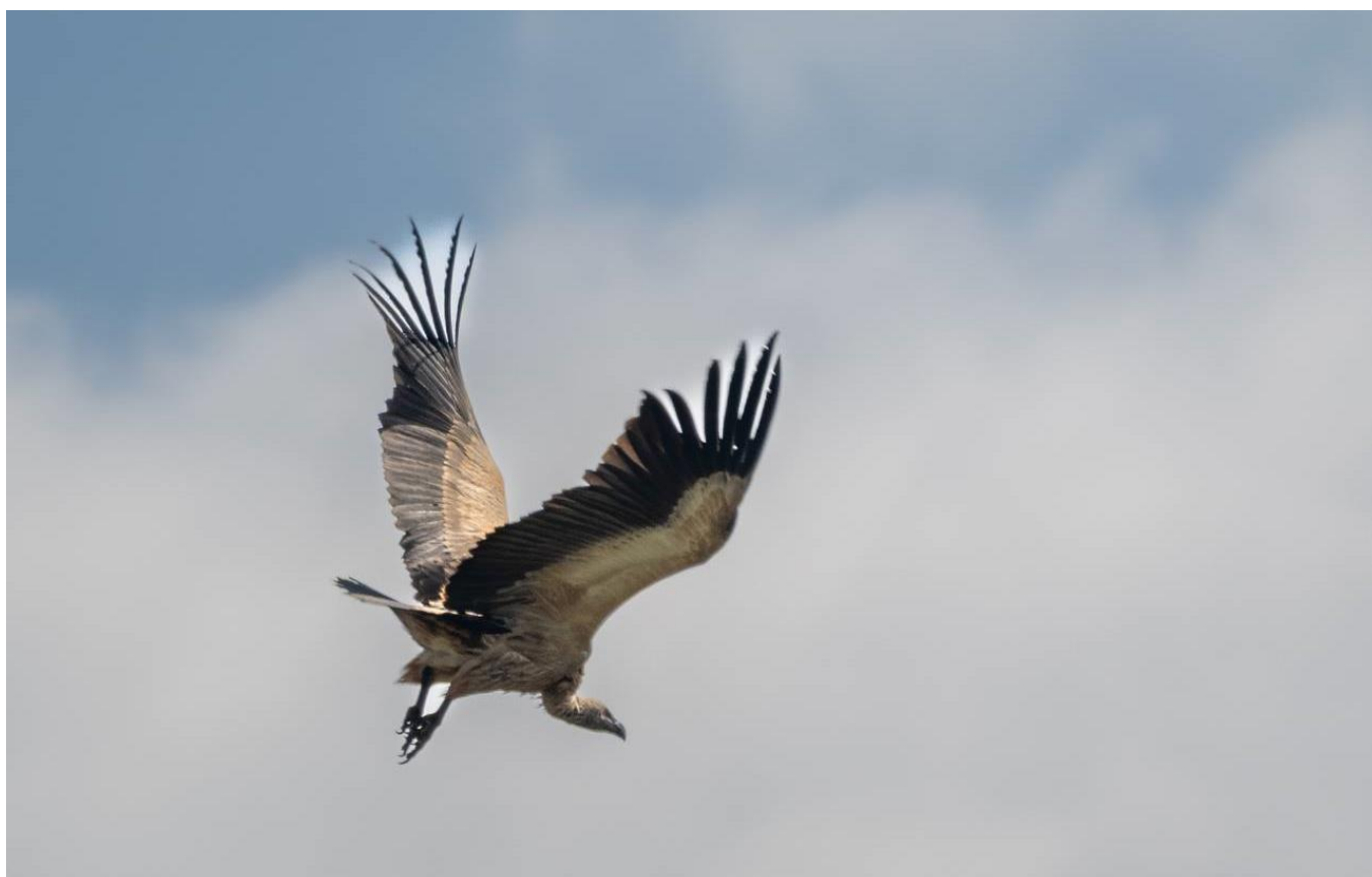
Cape Vulture [Brad Merwitz]

BLNG members saw a Yellow-bellied Greenbul at Wilge River Valley, with a Grey Tit-flycatcher another notable sighting.