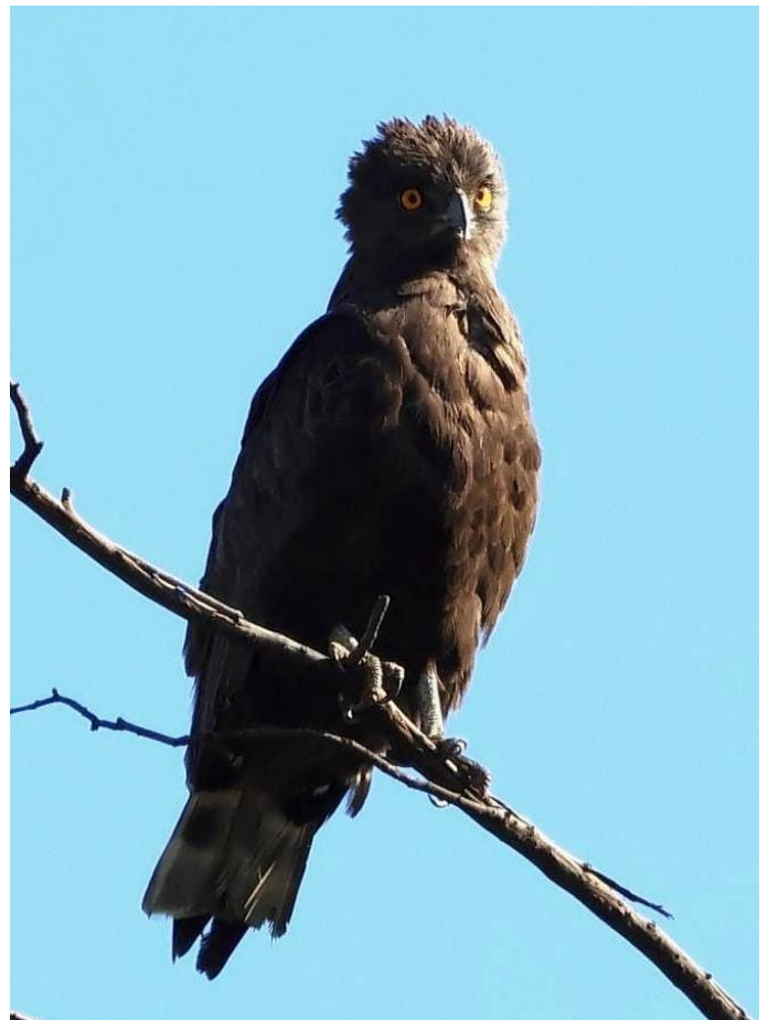
Brown Snake Eagle [Rulien Erasmus]