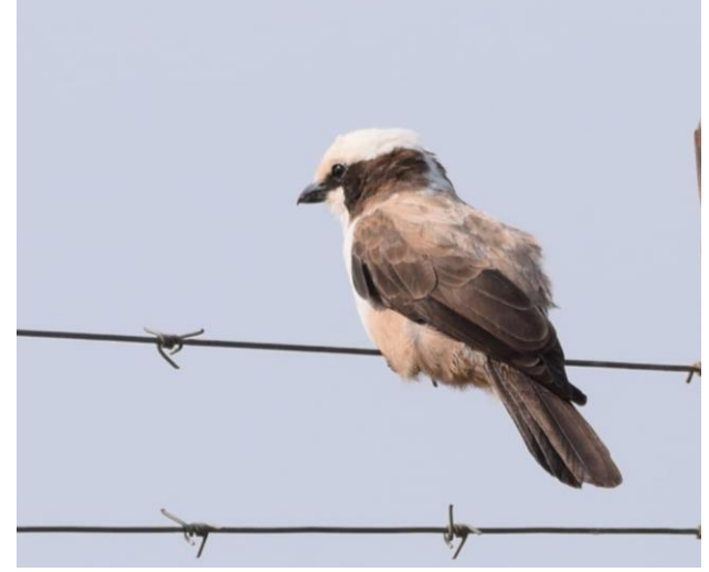
Southern White-crowned Shrike [Lynne Heydenreich]