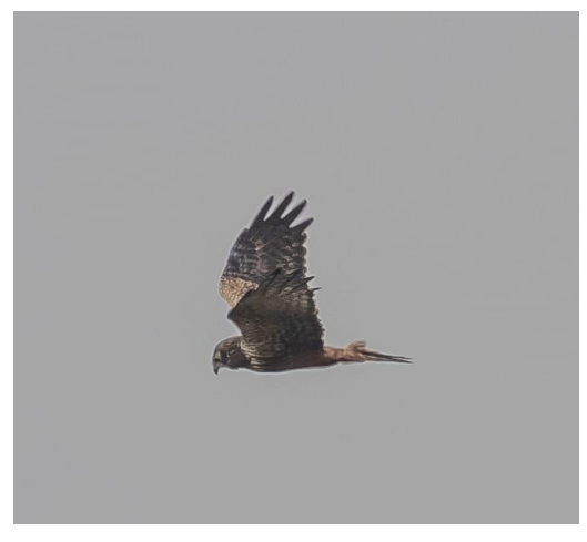
African Marsh Harrier