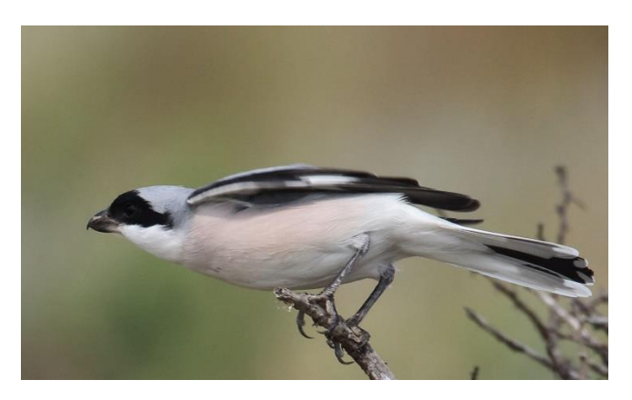
Lesser Grey Shrike