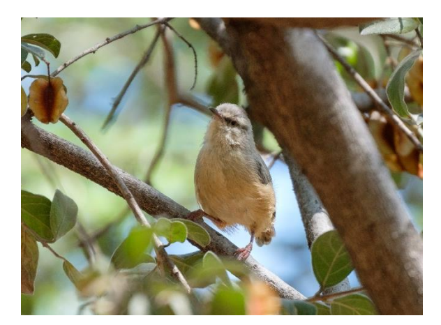
Long-billed Crombec [Wihan Barnard]

As the temperature climbed into the 30s (and real-feel up to 40 degrees), we finished the morning in the spacious shade of the picnic area, where we picked up a very inquisitive and confiding Chestnut-vented Warbler, boisterous Arrow-marked Babblers, a Common Sandpiper near the water's edge, and an elusive Grey Tit-Flycatcher. Perhaps the highlight of the morning was the assembly of three Wagtail species: a number of Cape Wagtails, a lone African Pied Wagtail, and two vividly coloured separate individual Western Yellow Wagtails (one at the picnic area, and one on the southern side of the angling area).