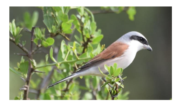
Red-backed Shrike [Gerdus Heydenreich]