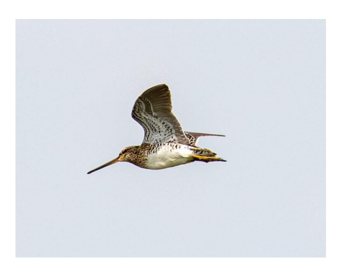
African Snipe

Woodland Kingfisher