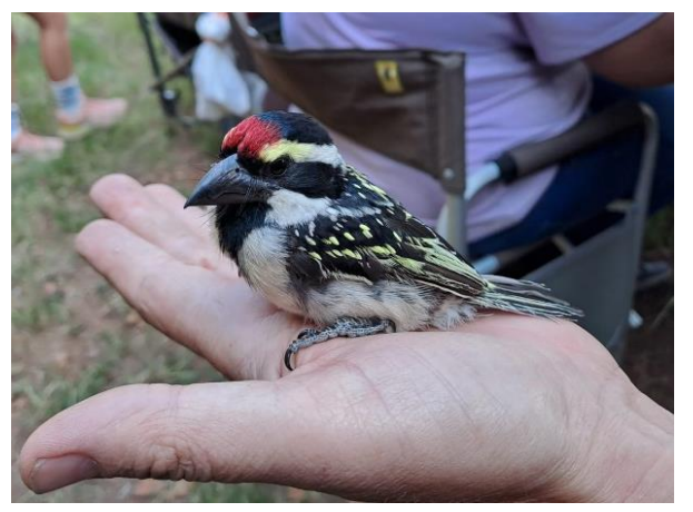
This Acacia Pied Barbet was on display at the bird ringing station.