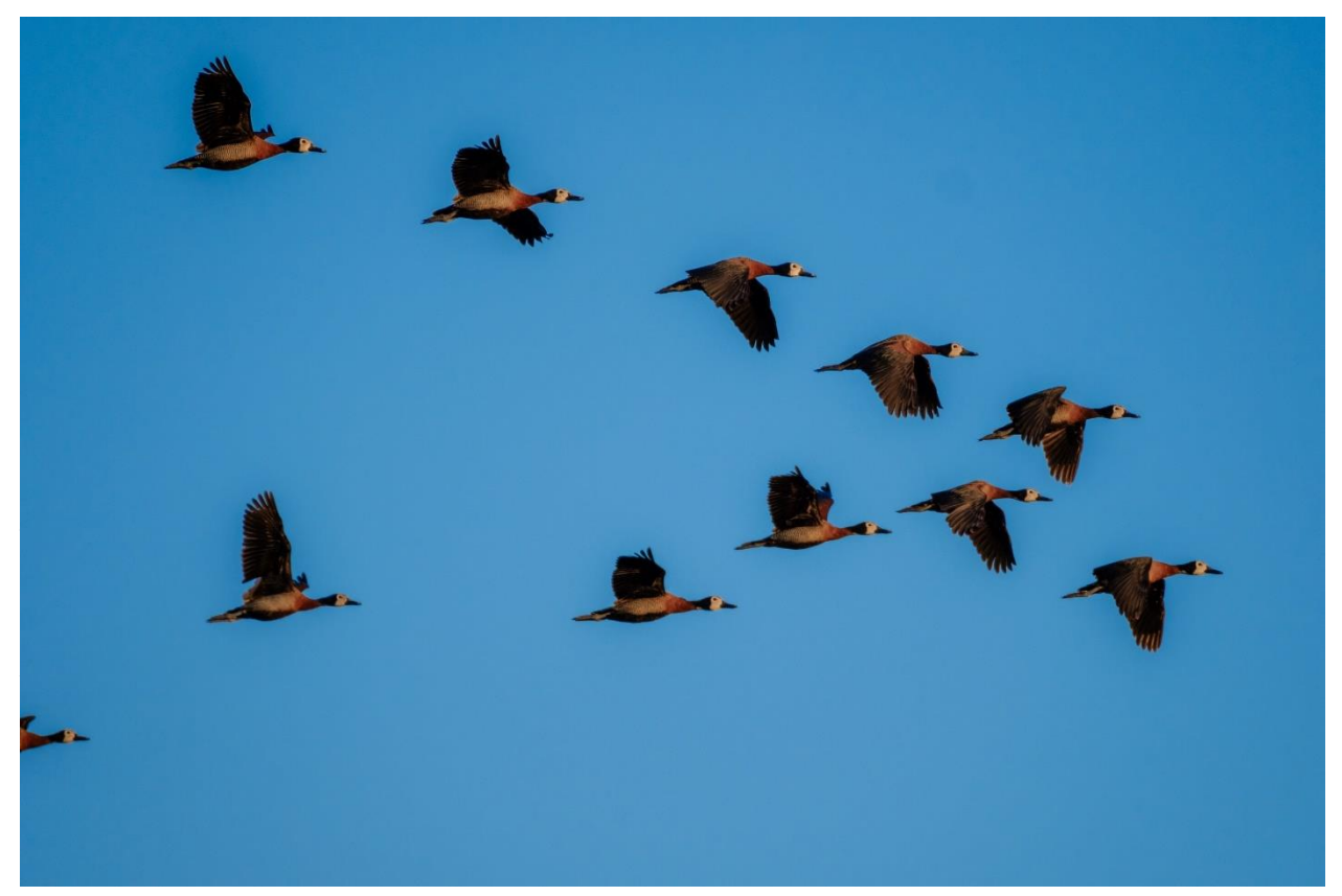
White-faced Whistling Ducks [Wihan Barnard]

The day started with birding on the bridge over the Crocodile River for about an hour, where we picked up Common House Martin among the Little and Whiterumped Swifts; Lesser Swamp, Common Reed, Great Reed, and Sedge Warblers in the reedbeds; and a good number of waterbirds passing overhead, including Squacco and Purple Herons, delightfully large and elegant groups of Glossy Ibis, and the charming piping calls of White-faced Whistling Ducks. There were also Marico Flycatchers, Burnt-necked Eremomela, and a Wahlberg's Eagle soaring overhead.