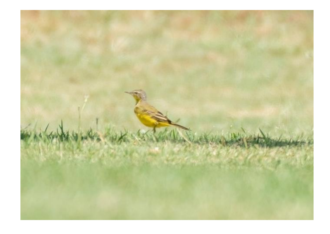
Western Yellow Wagtail [Wihan Barnard]

A very gratifying morning of birding, and all the more gratifying to get into airconditioned cars for the drive home!