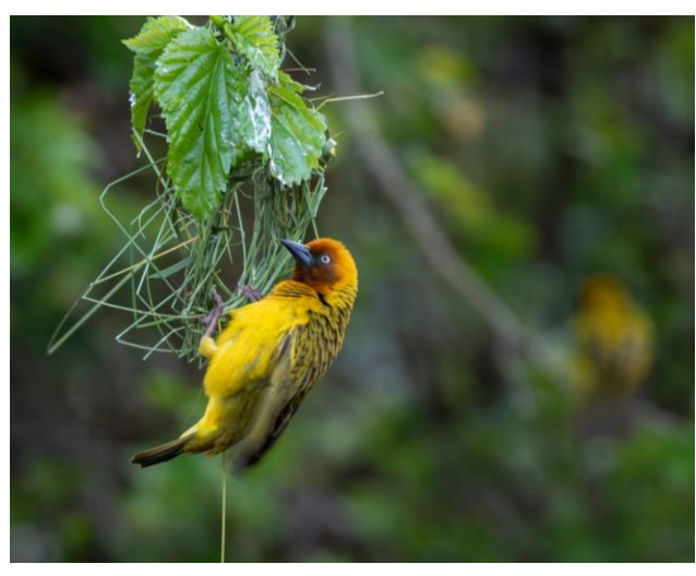
Cape Weaver [Roelof Jonkers]

A warm thank-you to all our club's outing leaders who send in summaries of species seen and the Bird of the Day, those who contribute articles, as well as our eager photographers, their photos. Without your contributions, BLiNG WiNGS would not be possible.