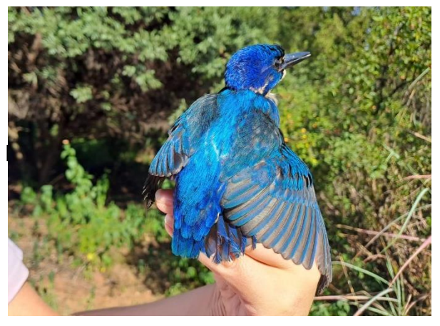
It was a privilege to study a Halfcollared Kingfisher.