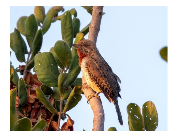
Red-throated Wryneck [Roelof Jonkers]