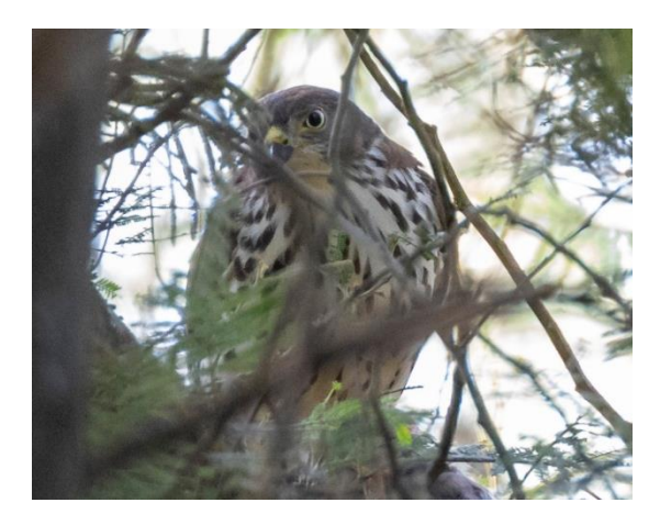
Little Sparrowhawk [Roelof Jonkers]