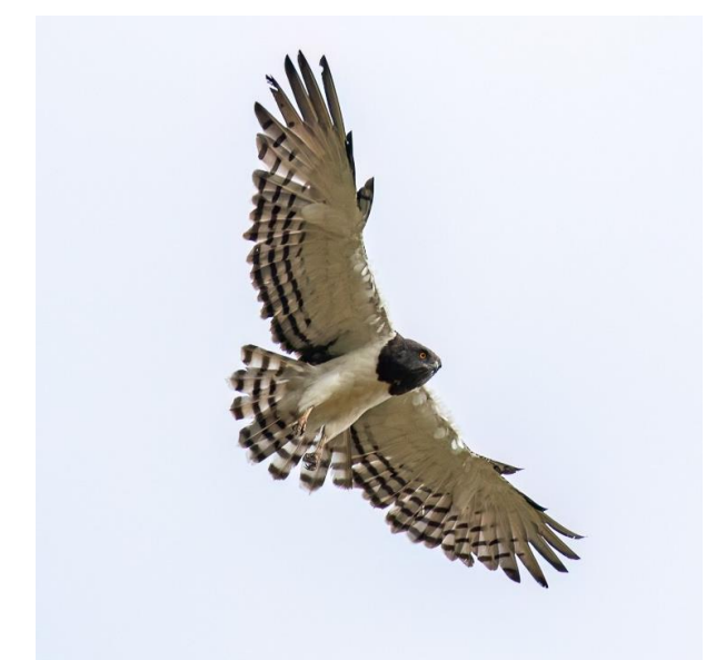
Black-chested Snake Eagle