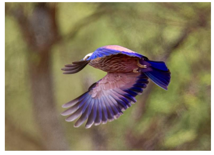
The Purple Rollers at the entrance to Crake Road were a great surprise, as was their noisy interaction. [Anne-Marie van der Merwe]