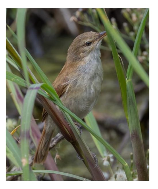
Common Reed Warbler